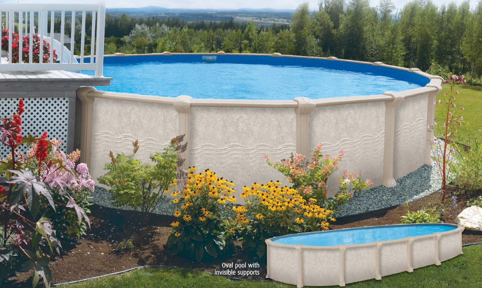
Oval pool with invisible supports

Take pride in owning a quality steel pool that is built for the long haul!